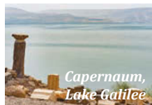
Capernaum, Lake Galilee