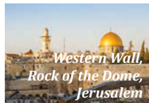
Western Wall, Rock of the Dome, Jerusalem