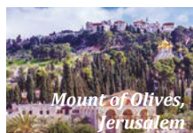
Mount of Olives, Jerusalem