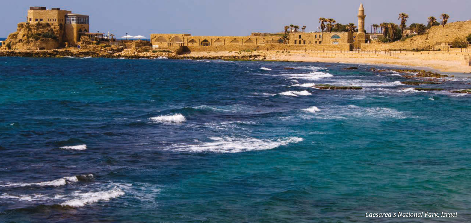
Caesarea's National Park, Israel

WITH FR. ROBERTO PADILLA SEPTEMBER 6 – 16, 2017