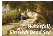
Waterfall, Ein Gedi Dead Sea