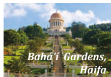
Bahá'í Gardens, Haifa