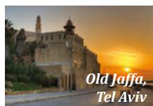
Old Jaffa, Tel Aviv