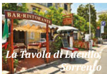
La Tavola di Lucullo, Sorrento