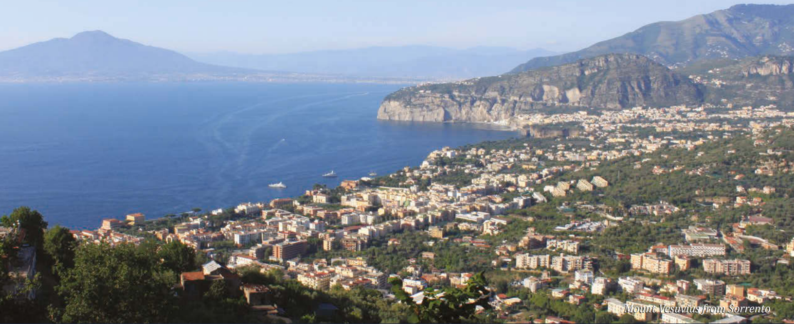
Mount Vesuvius from Sorrento

WEEKLY RESERVATIONS AVAILABLE FROM MAY 6, 2017 TO NOVEMBER 18, 2017