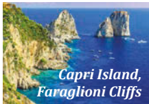
Capri Island, Faraglioni Cliffs