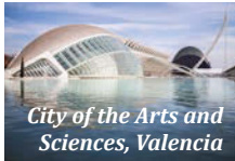
City of the Arts and Sciences, Valencia