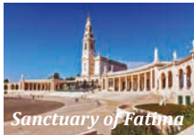
Sanctuary of Fatima