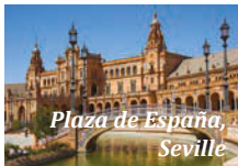
Plaza de España, Seville