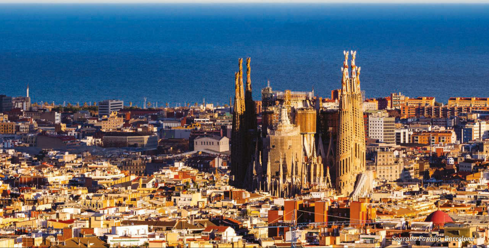
Sagrada Família, Barcelona

BARCELONA · VALENCIA · GRANADA · SEVILLE · LISBON · FATIMA