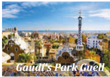
Gaudi's Park Guell