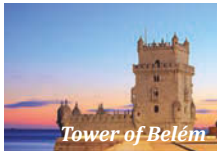
Tower of Belém