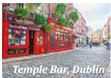
Temple Bar, Dublin