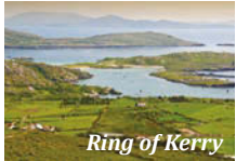
Ring of Kerry