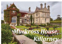
Muckross House, Killarney