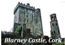
Blarney Castle, Cork