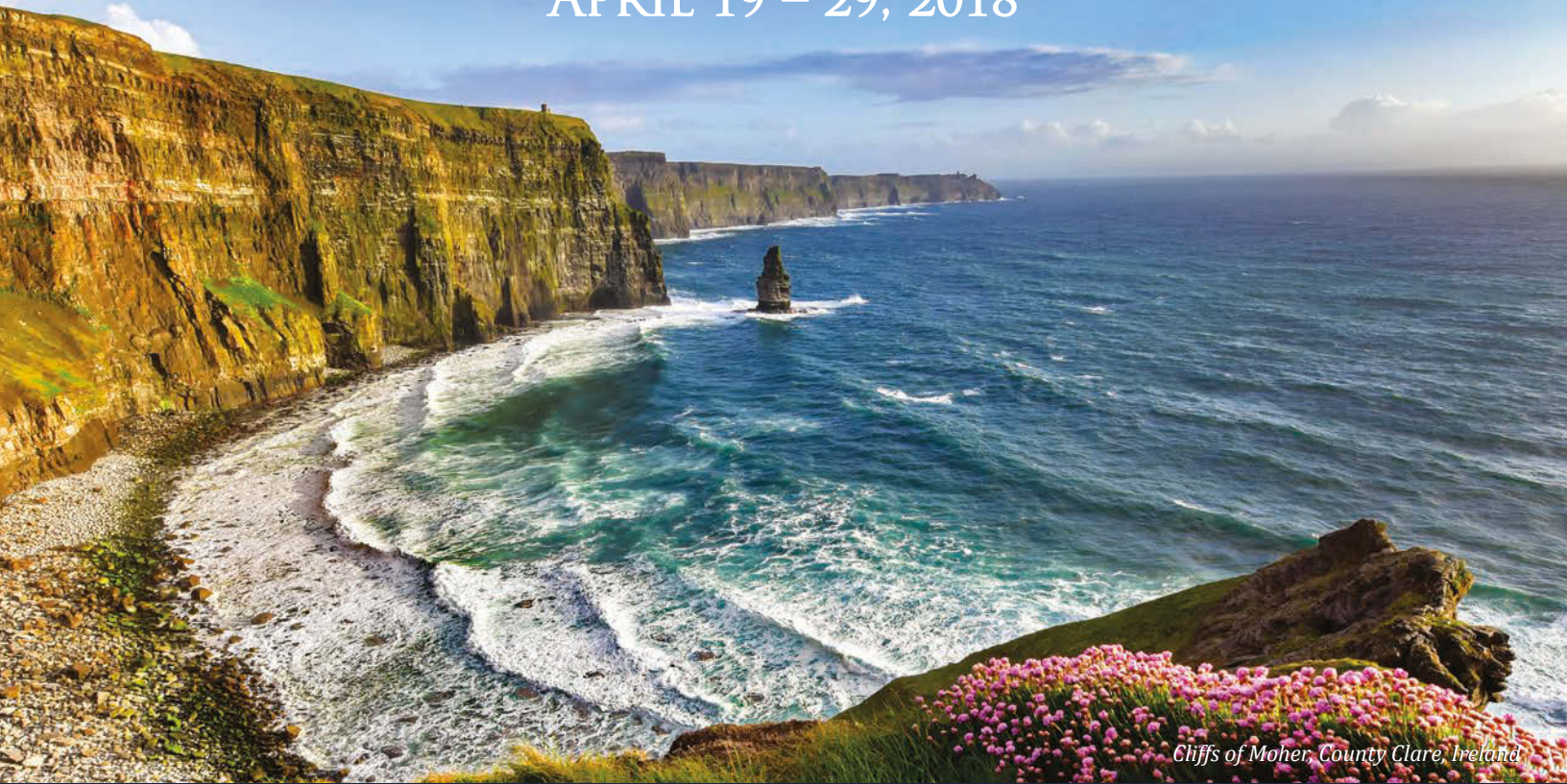
Cliffs of Moher, County Clare, Ireland

APRIL 5 – 15, 2018 / APRIL 12 – 22, 2018 APRIL 19 – 29, 2018